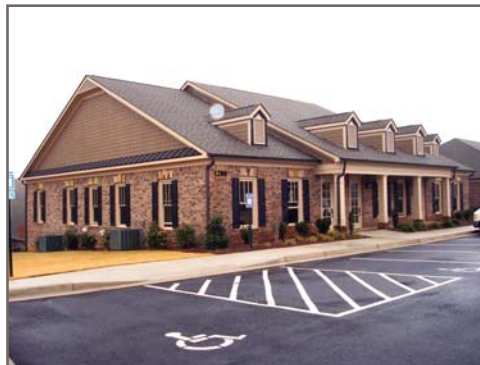
1 Story Office Building The Walk At Mars Hill