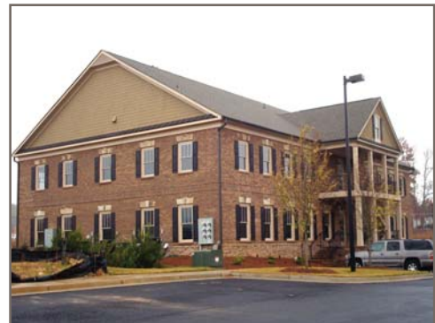
2 Story Office Building The Walk At Mars Hill